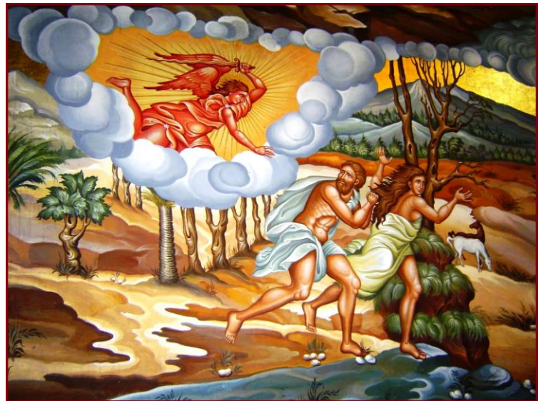
Expulsion of Adam and Eve from the Paradise

Bretheren: Now it is high time to awake out of sleep; for now our salvation is nearer than when we first believed. The night is far spent, the day is at hand. Therefore let us cast off the works of darkness, and let us put on the armor of light. Let us walk properly, as in the day, not in revelry and drunkenness, not in lewdness and lust, not in strife and envy. But put on the Lord Jesus Christ, and make no provision for the flesh, to fulfill its lusts. Receive one who is weak in the faith, but not to disputes over doubtful things. For one believes he may eat all things, but he who is weak eats only vegetables. Let not him who eats despise him who does not eat, and let not him who does not eat judge him who eats; for God has received him. Who are you to judge another's servant? To his own master he stands or falls. Indeed, he will be made to stand, for God is able to make him stand.