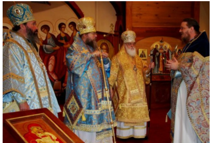
Metropolitan Kallistos concelebrates with Metropolitan Jonah (then OCA Primate) at St. Vladimir's Seminary in September 2011

May Metropolitan Kallistos' memory be eternal!