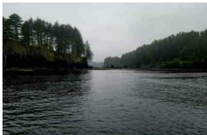
Images from Spruce Island in Alaska