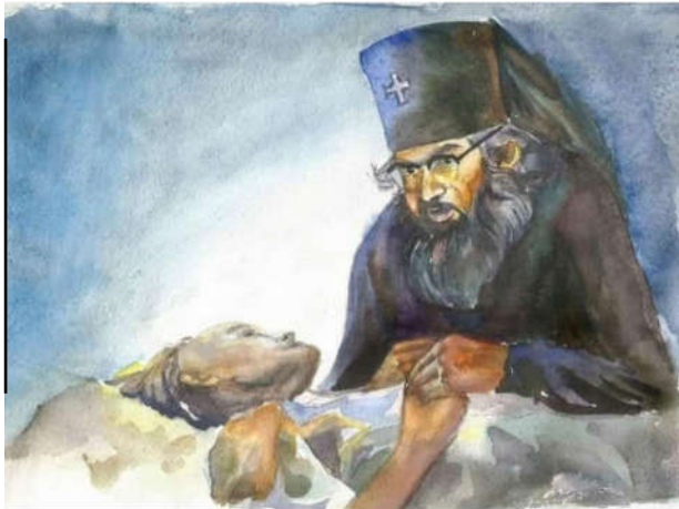
St. John (Maximovitch) of Shanghai & San Francisco 4 June 1896 - 2 July 1966

Show us who feel frightened and alone the same compassion that thou didst once show to the trembling fatherless ones.