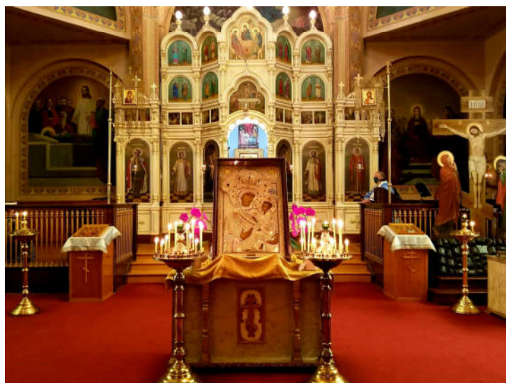
HOLY TRINITY CATHEDRAL IN CHICAGO