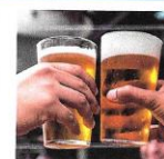
INTERNATIONAL BEER & WINE