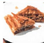
ASSORTED BAKED GOODS