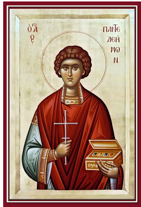
Greatmartyr and Healer Panteleimon July 27 th

Timothy, my son, be strong in the grace that is in Christ Jesus. And the things that you have heard from among many witnesses, commit these to faithful men