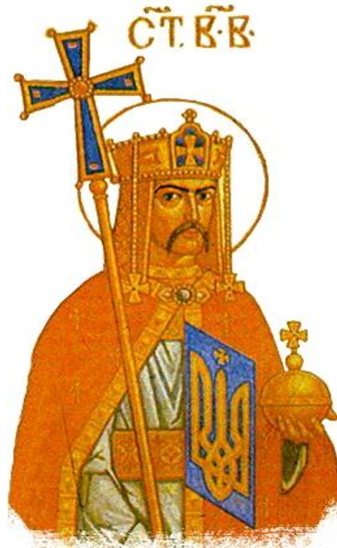
Holy Equal-to-the-Apostles Great Prince Vladimir, Enlightener of Rus' Feast Day – July 15 th

9:10 AM HOURS, 9:30 AM DIVINE LITURGY Followed by blessing of the Vehicles and Coffee Hour