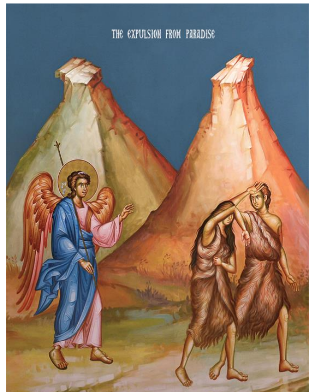
Expulsion of Adam from Paradise

The Lord said: If you forgive men their trespasses, your heavenly Father will also forgive you. But if you do not forgive men their trespasses, neither will your Father forgive your trespasses. Moreover, when you fast, do not be like the hypocrites, with a sad countenance. For they disfigure their faces that they