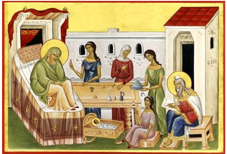
Nativity of St. John the Baptist Feast Day – June 24 th

9:10 AM HOURS, 9:30 AM DIVINE LITURGY Followed by Coffee Hour