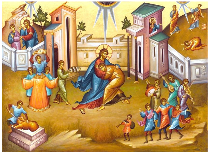
The Parable of the Prodigal Son

Brethren: All things are lawful for me, but all things are not helpful. All things are lawful for me, but I will not be brought under the power of any. Foods for the stomach and the stomach for foods, but God will destroy both it and them. Now the body is not for sexual immorality but for the Lord, and the Lord for the body. And God both raised up the Lord and will also raise us up by His power. Do you not know that your bodies are members of Christ? Shall I then take the members of Christ and make them members of a harlot? Certainly not! Or do you not know that he who is joined to a harlot is one body with her? For "the two," He says, "shall become one flesh." But he who is joined to the Lord is one spirit with Him. Flee sexual immorality. Every sin that a man does is outside the body, but he who commits sexual immorality sins against his own body. Or do you not know that your body is the temple of the Holy Spirit who is in you, whom you have from God, and you are not your own? For you were bought at a price; therefore, glorify God in your body and in your spirit, which are God's.