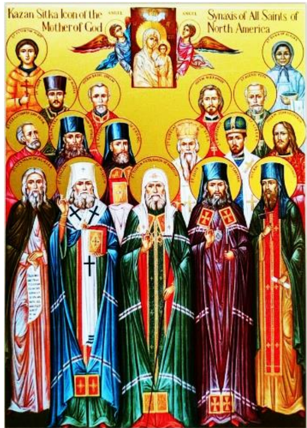
All Saints of America