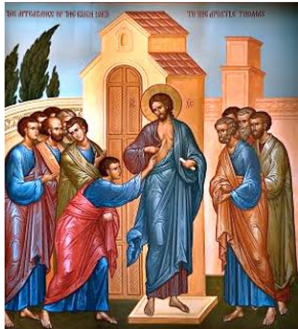
The Belief of Thomas

In those days, through the hands of the apostles many signs and wonders were done among the people. And they were all with one accord in Solomon's Porch. Yet none of the rest dared join them, but the people esteemed them highly. And believers were increasingly added to the Lord, multitudes of both men and women, so that they brought the sick out into the streets and laid them on beds and couches, that at least the shadow of Peter passing by might fall on some of them. Also, a multitude gathered from the surrounding cities to Jerusalem, bringing sick people and those who were tormented by unclean spirits, and they were all healed. Then the high priest rose up, and all those who were with him (which is the sect of the Sadducees), and they were filled with indignation, and laid their hands on the apostles and put them in the common prison. But at night an angel of the Lord opened the prison doors and brought them out, and said, "Go, stand in the temple and speak to the people all the words of this life."