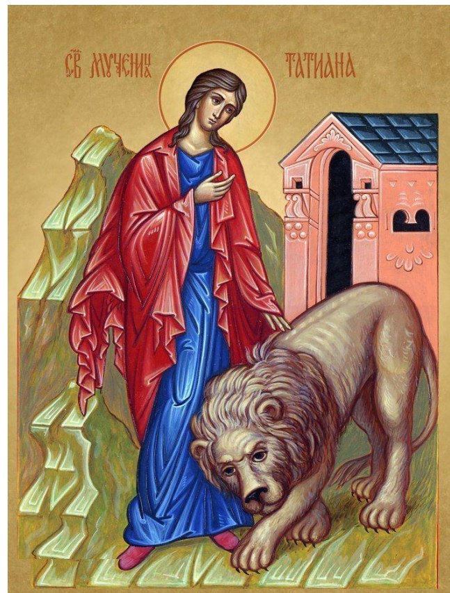
Martyr Tatiana of Rome Feast Day – January 12 th

At that time, when Jesus heard that John had been put in prison, He departed to Galilee. And leaving Nazareth, He came and dwelt in Capernaum, which is by the sea, in the regions of Zebulun and