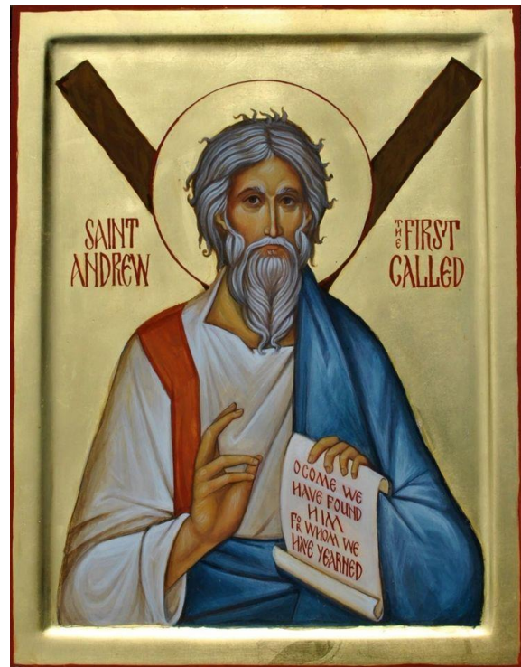
St. Andrew the Apostle Feast Day – November 30 th