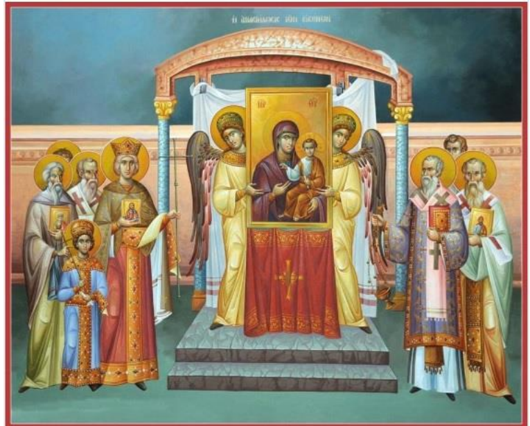
Sunday of Orthodoxy

Bretheren: By faith Moses, when he became of age, refused to be called the son of Pharaoh's daughter, choosing rather to suffer affliction with the people of God than to enjoy the passing pleasures of sin, esteeming the reproach of Christ greater riches than the treasures in Egypt; for he looked to the reward. And what more shall I say? For the time would fail me to tell of Gideon and Barak and Samson and Jephthah, also of David and Samuel and the prophets: who through faith subdued kingdoms, worked righteousness, obtained promises, stopped the mouths of lions, quenched the violence of