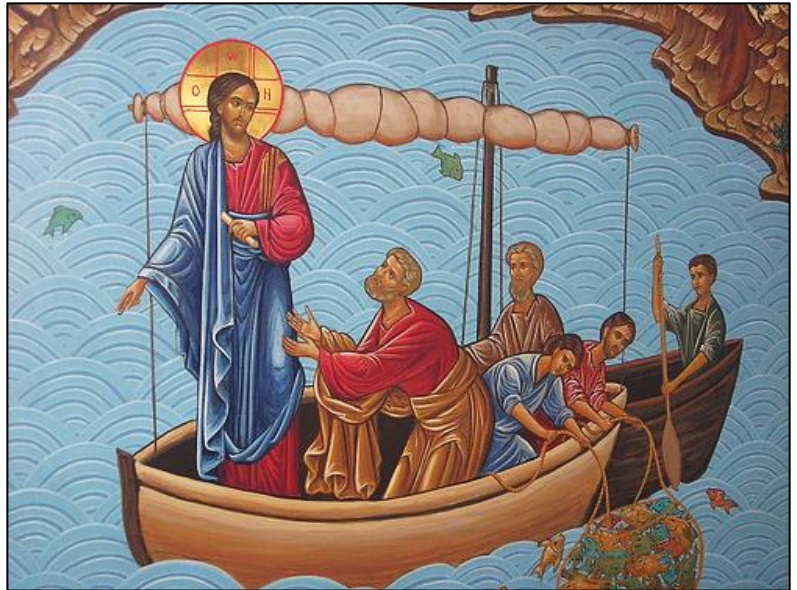
Miraculous catch of fish

9:10 AM HOURS, 9:30 AM DIVINE LITURGY Followed by Coffee Hour