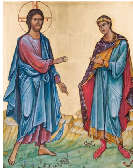
Christ and Rich Young Ruler

Brethren: I declare to you the gospel which I preached to you, which also you received and in which you stand, by which also you are saved, if you hold fast that word which I preached to you – unless you believed in vain. For I delivered to you first of all that which I also received: that Christ died for our sins according to the Scriptures, and that He was buried, and that He rose again the third day according to the Scriptures, and that He was seen by Cephas, then by the twelve. After that He was seen by over five hundred brethren at once, of whom the greater part remain to the present, but some have fallen asleep. After that He was seen by James, then by all the apostles. Then last of all He was seen by me also, as by one born out of due time. For I am the least of the apostles, who am not worthy to be called an apostle, because I persecuted the church of God. But by the grace of God, I am what I am, and His grace toward me was not in vain; but I labored more abundantly than they all, yet not I, but the grace of God which was with me. Therefore, whether it was I or they, so we preach and so you believed.