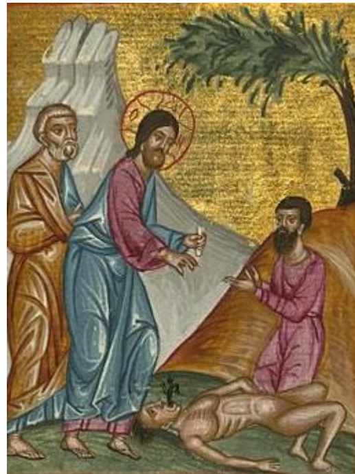
Healing of the epileptic boy

Brethren: I think that God has displayed us, the apostles, last, as men condemned to death; for we have been made a spectacle to the world, both to angels and to men. We are fools for Christ's sake, but you are wise in Christ! We are weak, but you are strong! You are distinguished, but we are dishonored! To the present hour we both hunger and thirst, and we are poorly clothed, and beaten, and homeless. And we labor, working with our own hands. Being reviled, we bless; being persecuted, we endure; being defamed, we entreat. We have been made as the filth of the world, the offscouring of all things until now. I do not write these things to shame you, but as my beloved children I warn you. For though you might have ten thousand instructors in Christ, yet you do not have many fathers; for in Christ Jesus, I have begotten you through the gospel. Therefore, I urge you, imitate me.