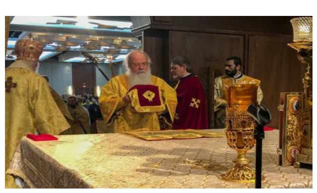
Met. Tikhon at Liturgy