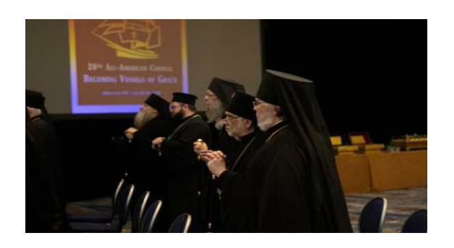
Synod of bishops during prayer service