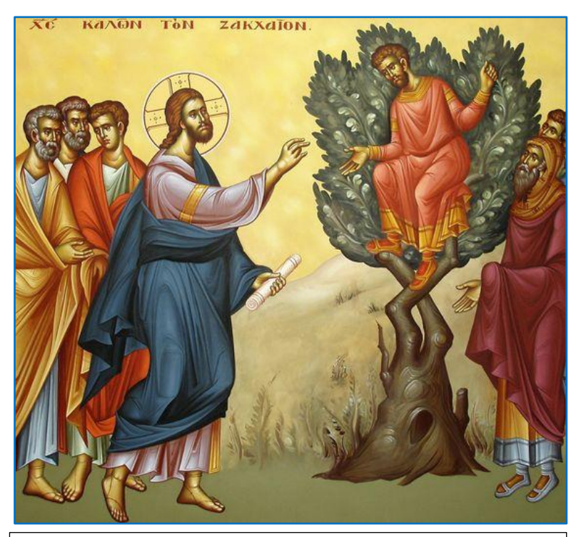
Calling of Zacchaeus