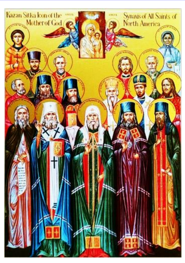
All Saints of America