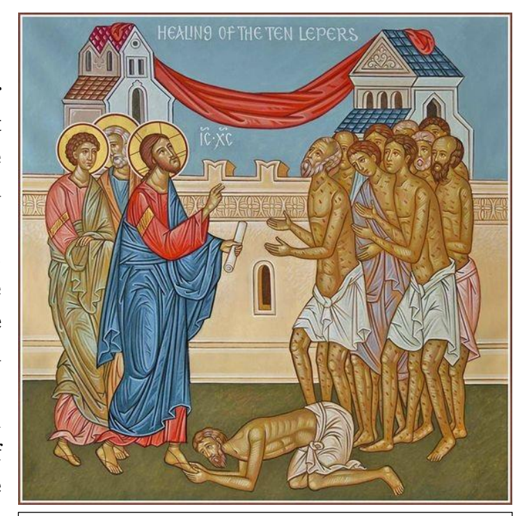
Healing of the Ten Lepers

Brethren: Be strong in the Lord and in the power of His might. Put on the whole armor of God, that you may be able to stand against the wiles of the devil. For we do not wrestle against flesh and blood, but against principalities, against powers, against the rulers of the darkness of this age, against spiritual hosts of wickedness in the heavenly places. Therefore, take up the whole armor of God, that you may be able to withstand in the evil day, and having done all, to stand. Stand therefore, having girded your waist with truth, having put on the breastplate of righteousness, and having shod your feet with the preparation of the gospel of peace; above all, taking the shield of faith with which, you will be