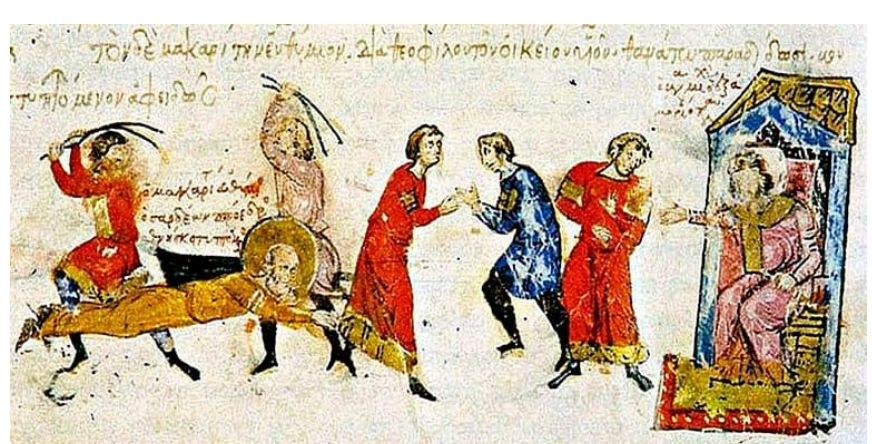
Execution of monks (miniature image from the Chronicle of John Skylitzes, early 13th century)

The icon-worshippers' main opponents were the politicians who took up arms against them and blamed the ignorance of the people on the "clerical" regime. They were no longer content with "cancelling" icons. Instead, they started