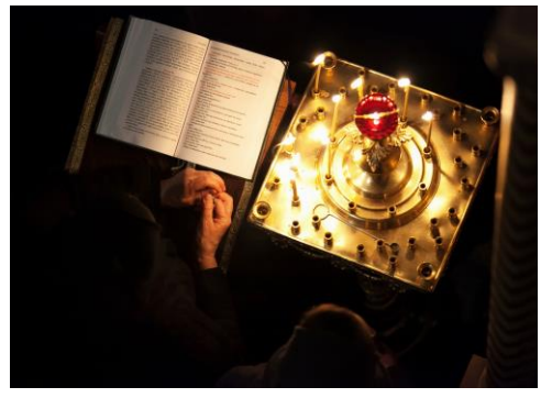
Fasting during the Great Lent World of Orthodoxy

The Great Lent is the longest fasting season of the year for the Orthodox. We all know about the importance of prayer, almsgiving and fasting - the three pillars of Lent. But what are the rules of fasting and are there some things we should not do during this season? Read this article and find out.