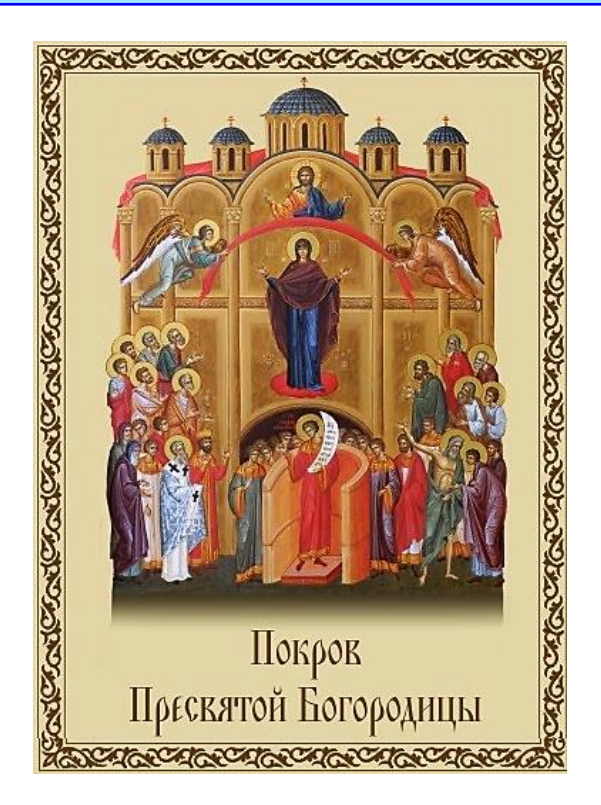
Protection of the Most Holy Theotokos Feast Day – October 1<sup>st</sup>

Brethren: You are the temple of the living God. As God has said: "I will dwell in them and walk among them. I will be their God, and they shall be My people." Therefore "Come out from among them and be separate, says the Lord. Do not touch what is unclean, and I will receive you." "I will be a Father to you, and you shall be My sons and daughters, says the LORD Almighty." Therefore, having these promises, beloved, let us cleanse