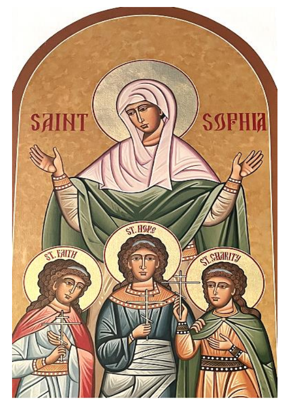
St. Sophia and her three Daughters, Faith, Hope and Love Feast Day – September 17<sup>th</sup>